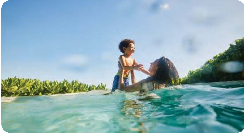
Swimming pools in each cluster including kids' pool, lap pool, pool deck with cabanas, pool bar, spa pool, cascading waterfall