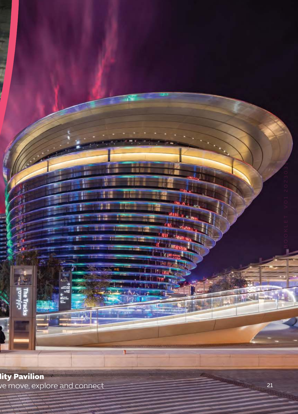
Alif – The Mobility Pavilion Exploring how we move, explore and connect