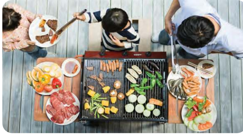
BBQ areas, outdoor dining pavilion