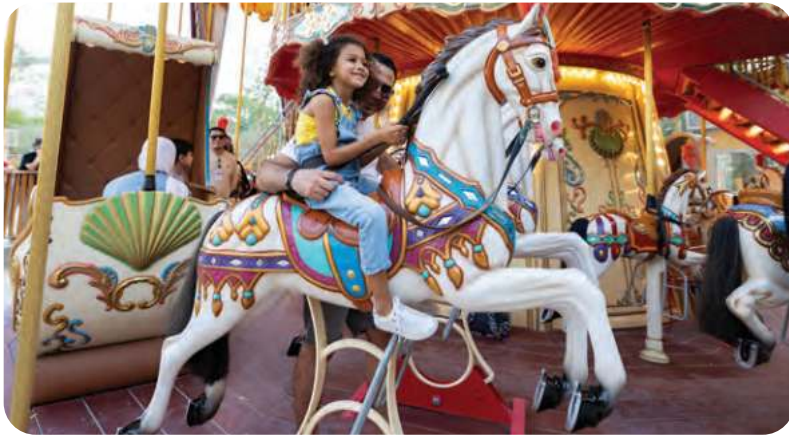
Kids' play area