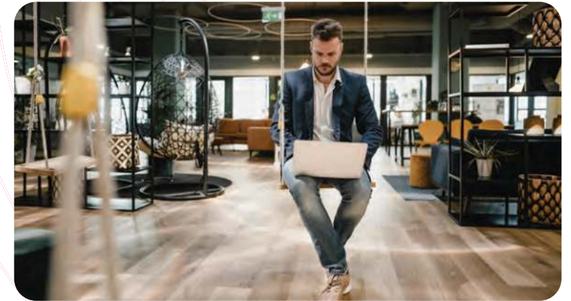
Various lounges for movies, co-working, art, and music