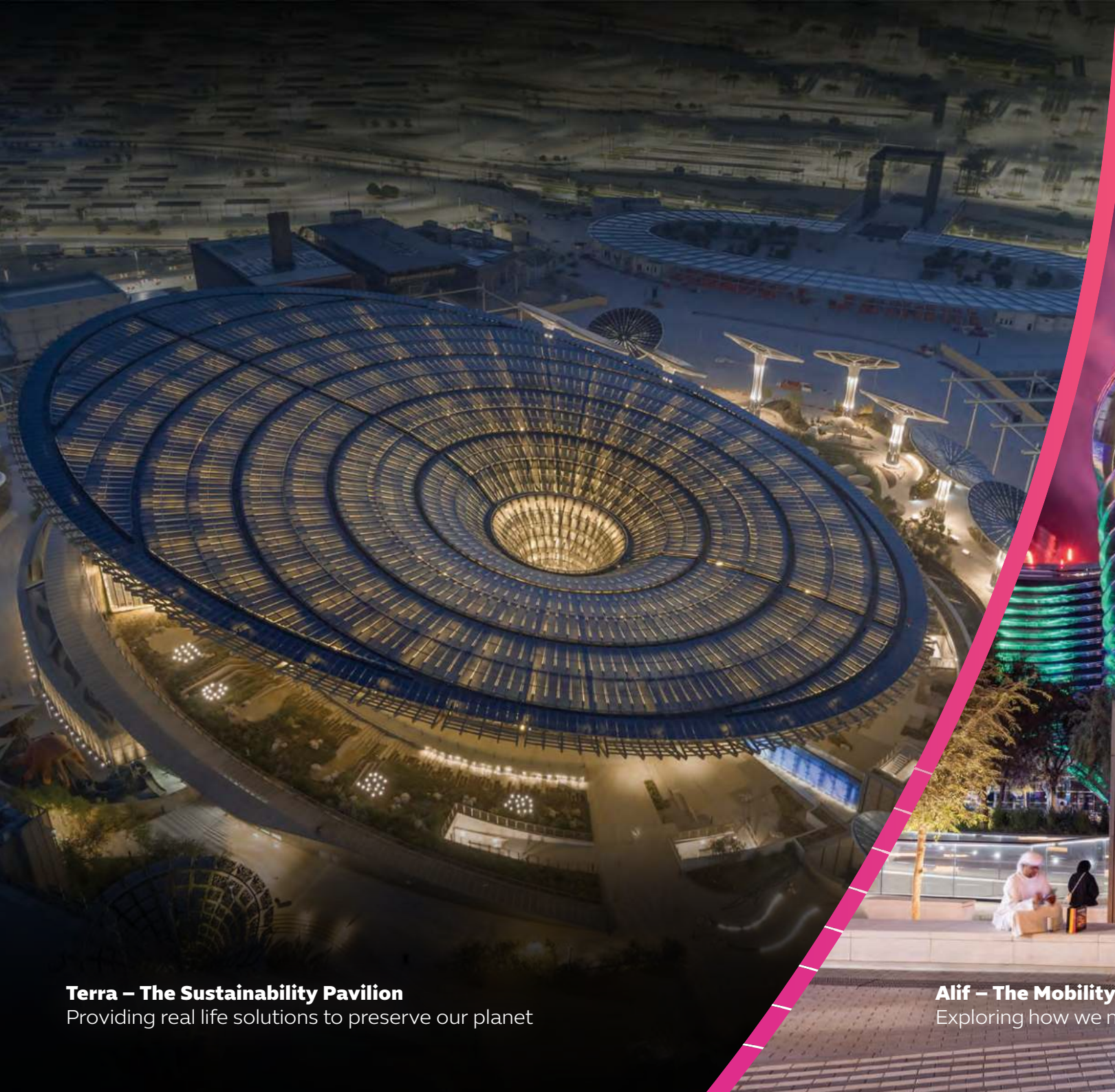
Terra – The Sustainability Pavilion Providing real life solutions to preserve our planet