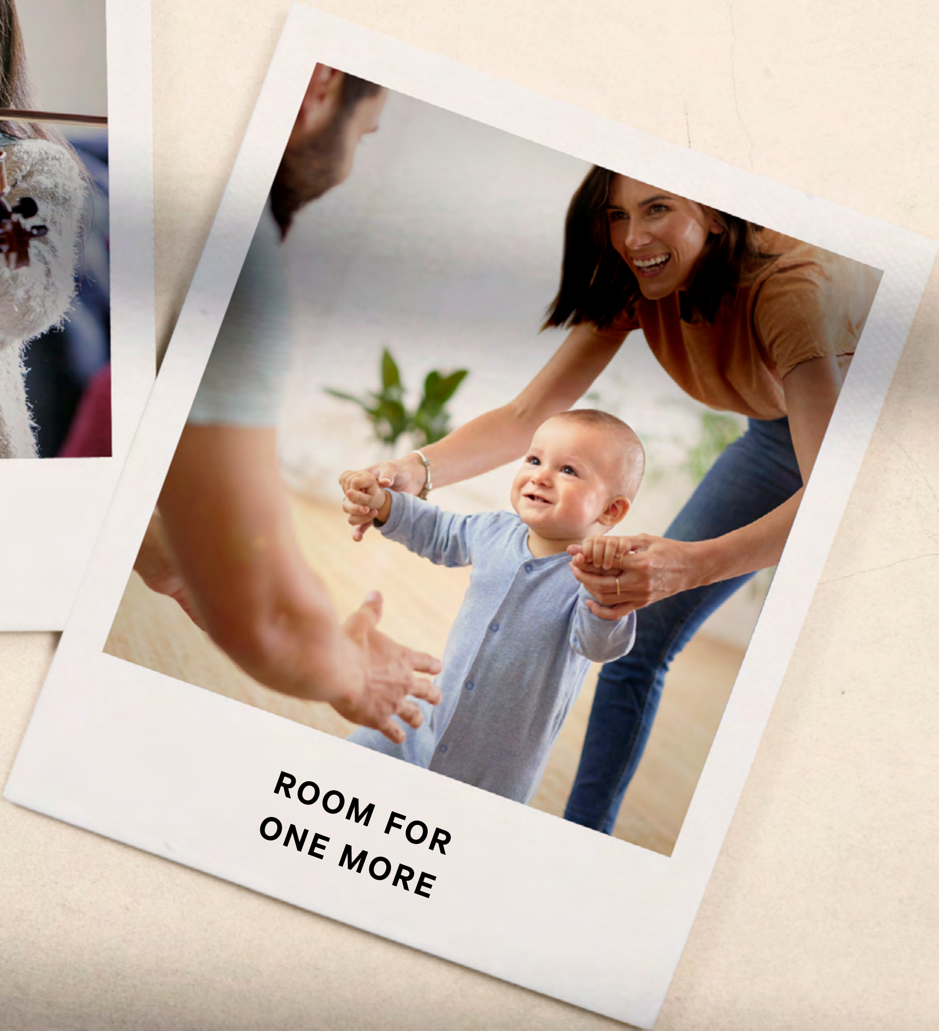
ROOM FOR ONE MORE