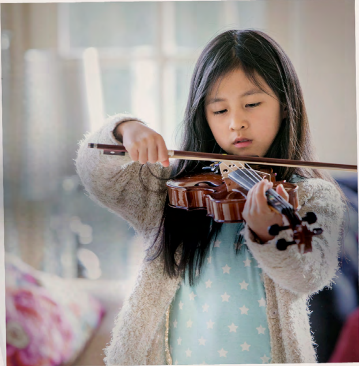
MORE ROOM FOR GROWTH